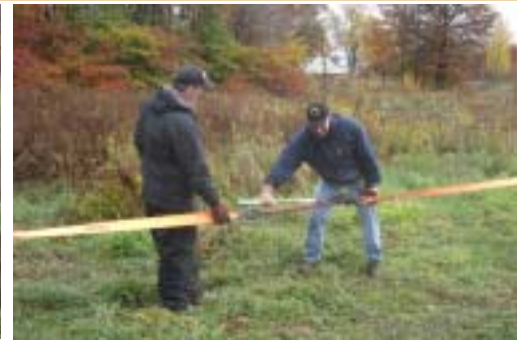
Hi-Lift jack as a "poor man's winch"

This fall I had the opportunity to attend the 4 Wheel Drive Awareness Training. I was interested for myself but also for my daughter, and one of her friends, who both often accompany me wheeling. We trailered our rig, since it was a 6 hour drive to the Kalamazoo area.