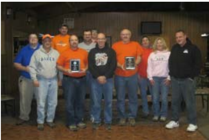
Members of What Lies Beyond Jeep Club of Michigan proudly showing off their Club of the Year Award