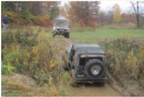
winching demo using synthetic line