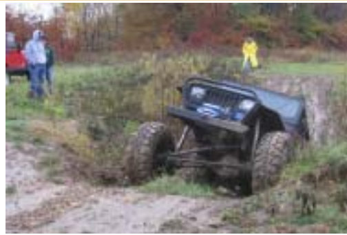
Practicing in the mud