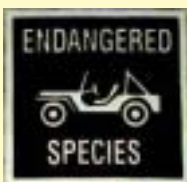
Endangered Species Stickers $3

Special Order items also available: Jackets, etc... Custom Lettering Available for most articles. Contact our vendor directly for custom orders at www.feemb.net or contact the Store Manager for more information.