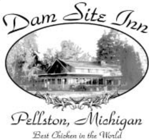
The Dam Site Inn was recognized as Associate Member of the Year.