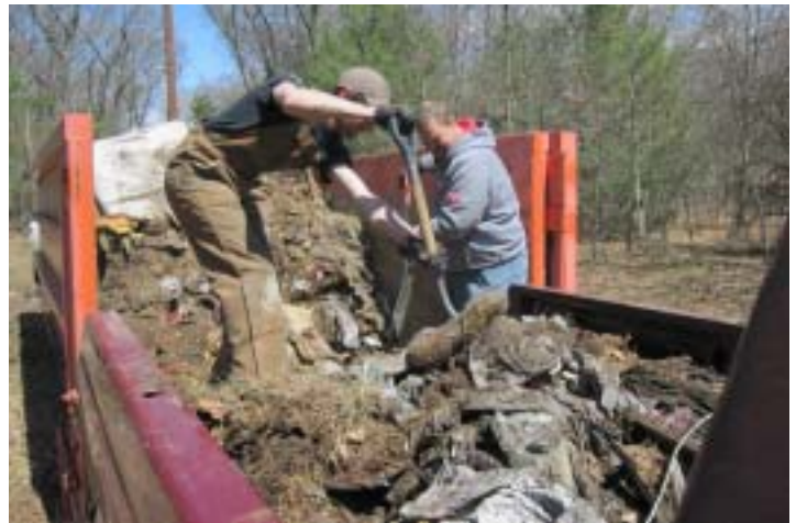
Volunteers filling dumpsters at two of the clean-up sites