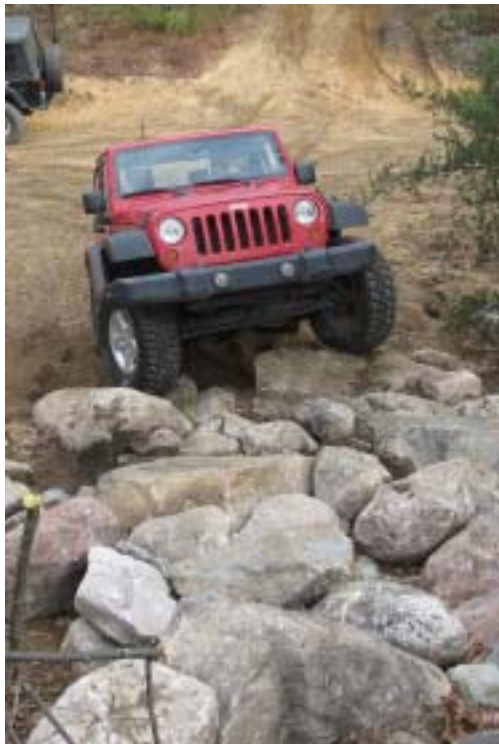
Starting up one of the hills at the Rock Challenge Area in St. Helen