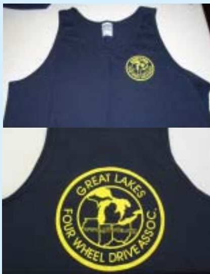
Tank Tops $12