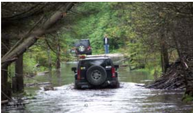
Rolling Slow through 30" of water in Conner's Hole on Drummond Island

We had a GREAT weather day for the trails, after a night of torrential rains. There would be no dust on the ride this day and plenty of water in the holes to splash in. The island is a ROCK and its depressions hold water and do not allow it to be absorbed into the rock, so it basically has to evaporate. After a hearty breakfast at the Bear Track Inn, we started on our trail ride out of the back of the parking lot of the Drummond Island Resort. Pat Brower was our Trail Leader for the Drummond Island trails. We wound our way through the forest with an initial destination of the Marble Head Cliffs, overlooking Lake Huron. We