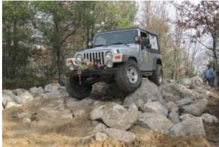
Stock vehicles will have a better experience on the “bunny hill” thanks to changes suggested by GLFWDA members invited to test the course.

frame of reference. The final design for the rock crawl area was submitted, but unfortunately the weather, contract negotiations, and