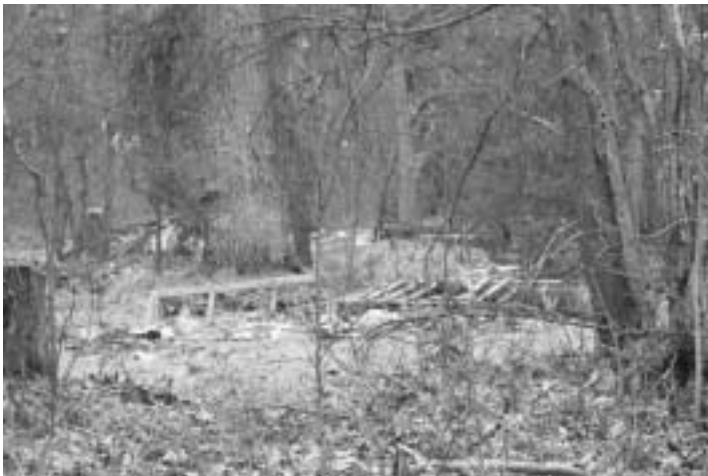
Illegal dumping sites in the Manistee Forrest

A free hot dog lunch was provided by the Two Trackers, made possible by the generous donations of local businesses. Lunchtime proved to be a fun time, where volunteers connected to share stories about their finds in the woods. Children used this time to collect their prizes from the scavenger hunt. A 50/50 raffle was drawn, with proceeds helping to fund future clean up events.