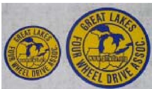
4" or 6" GLFWDA Stickers $1