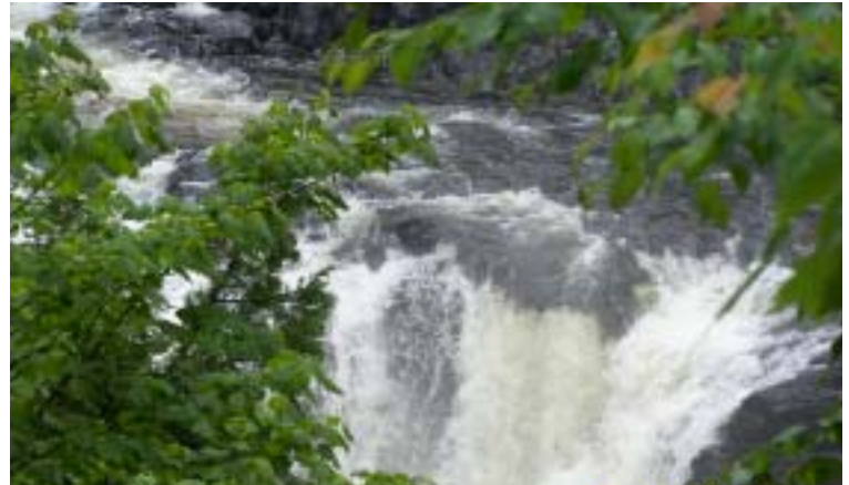
Batchawana River Falls

week. This time we were headed north into Ontario, Canada for our third event, the post-AGM trail rides. We had 18 participants registered for this event and a good share of them were convoying together. Many were trailering their rigs and since I was driving my WJ Grand Cherokee, I leaped frogged ahead of the group to verify fuel stops and parking locations for this size group. I have a HAM radio and so did our Trail Leader, who was towing and stayed with the group. He relayed all important information to the rest of the convoy through the use of CB radios. We stopped in Mackinaw City for lunch and some sight seeing downtown and at Fort Michilimackinac.