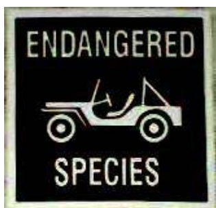
Endangered Species Stickers $3

Special Order items also available: Jackets, Hoodies, Etc... Custom Lettering Available for most articles. Contact our vendor directly for custom orders at www.feemb.net or contact the Store Manager for more information.