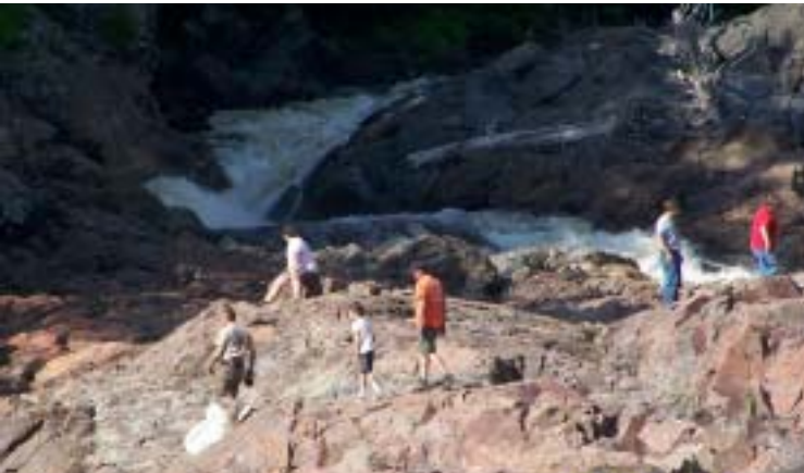
Exploring Chippewa Falls

the area have been attempting to get the present owners to cleanup this site. This abandoned mine produced copper, silver and gold. As we approached the entrance to the mine, we were blasted with a chilling breeze. We entered the mine with flashlights, lanterns and jackets. We had been warned through the first section of mine we would be walking in water, possibly 6-12 inches deep. After clearing the first 50 feet or so, we reached damp gravel. A surprise, to others and myself, was soon to be realized. After another 50 feet or so of pitch black, a foggy mist filled the air. Shining my light around produced an eerie translucent look about the mine floor ... a few steps more and I realized we were now walking on ICE. Ice a foot thick, not 100 feet or so from the entrance where it was in the