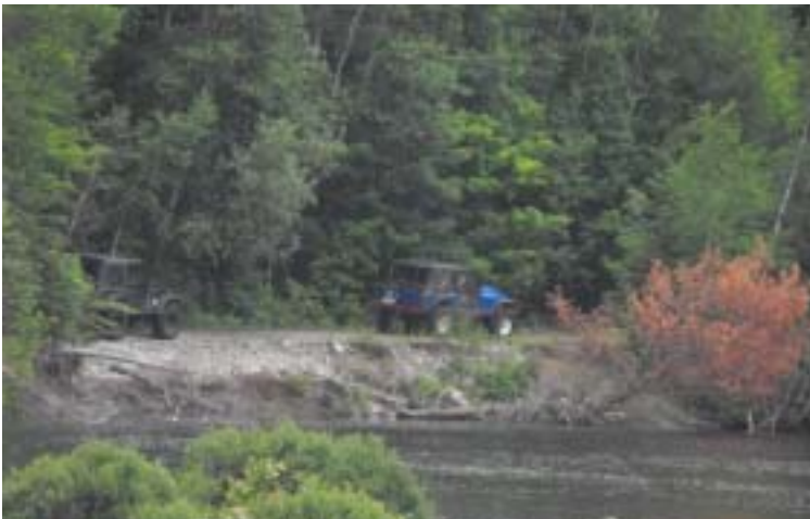
Batchawana River Trail