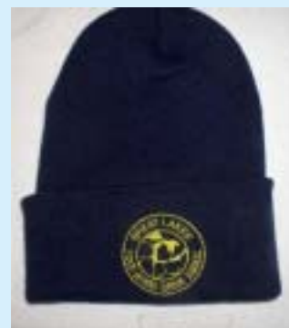
Winter Hats $15 Baseball Caps $15

Also available: Sweat-shirts, Long Sleeved Shirts, and more!